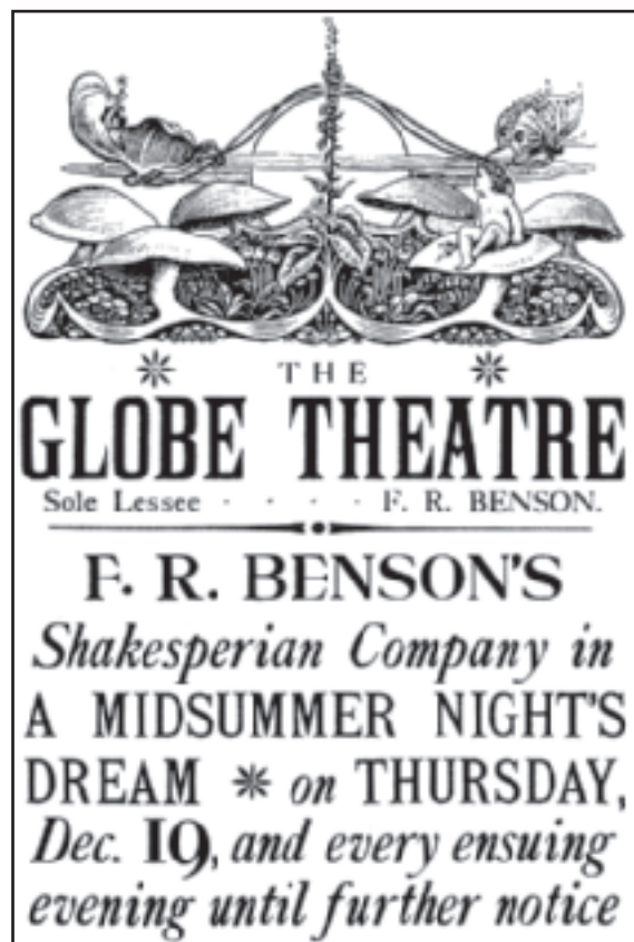
Poster advertising a performance of "A Midsummer Night's Dream" by F.R. Benson's Shakespearean Company at the Globe theatre, c. 1890.